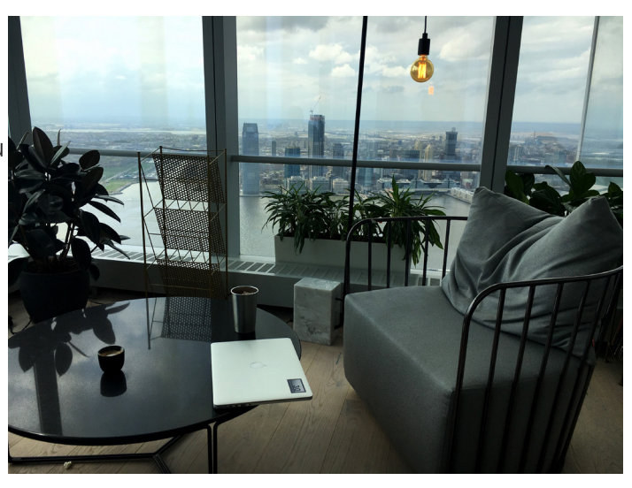
Performance coaching can increase work performance by 70 percent*

So the question is, what do you need? Whom do you wish was on your side, as you make your way through your own hero's journey?